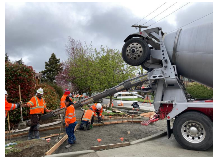
Bottom: Constructing curb ramps as part of the Andover and Dakota NSF project.