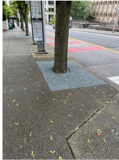
Tree pit on 5th Ave filled for bus passenger comfort and safety