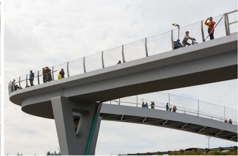
John Lewis Memorial Bridge