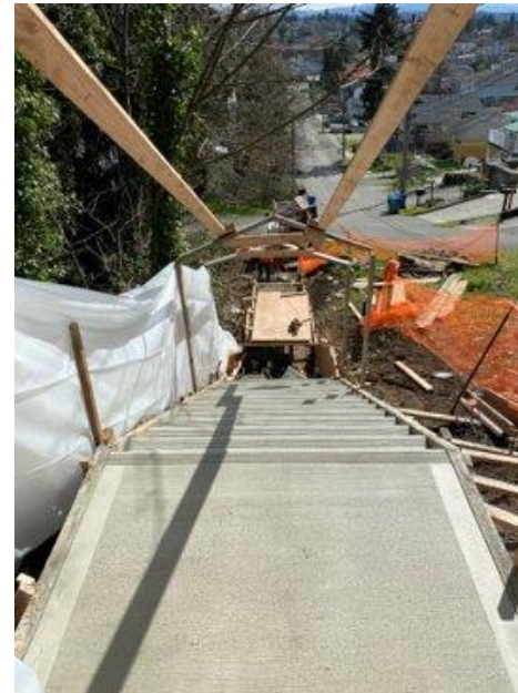
Stairway repair at S Morgan St