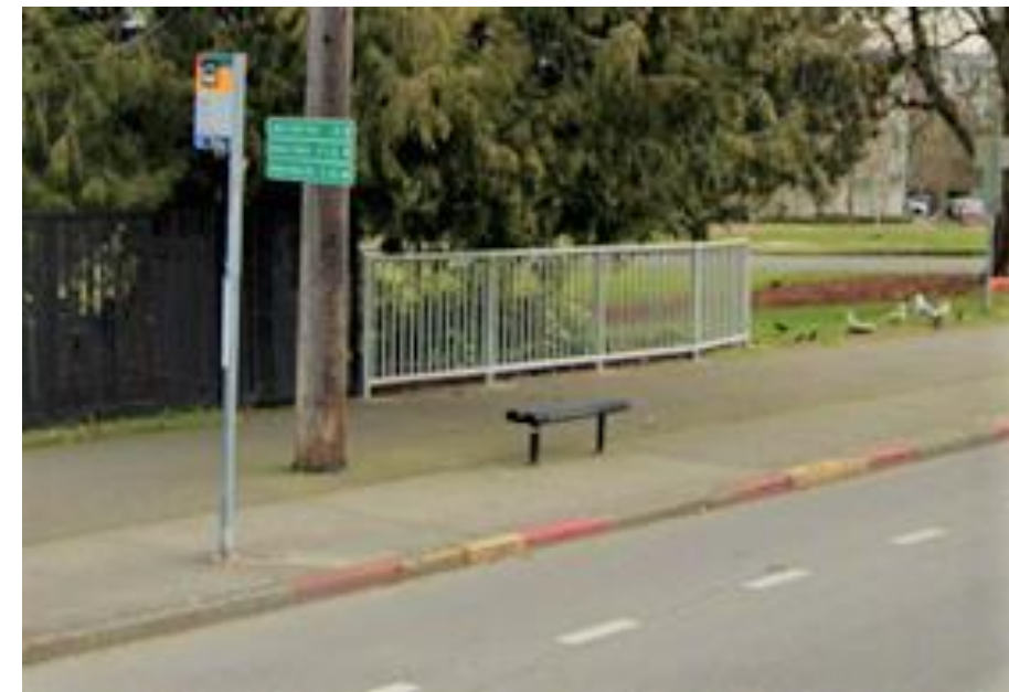
Top: Bench at S Myrtle Pl and S Holly Park.