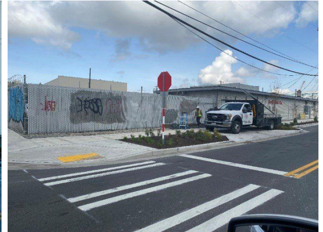
Northwest corner of 5th Ave S and S Portland St improved in South Park