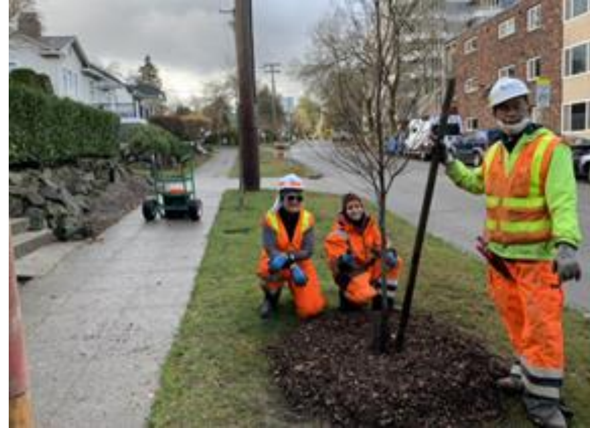
One of over 220 new trees planted in Q1 2023.