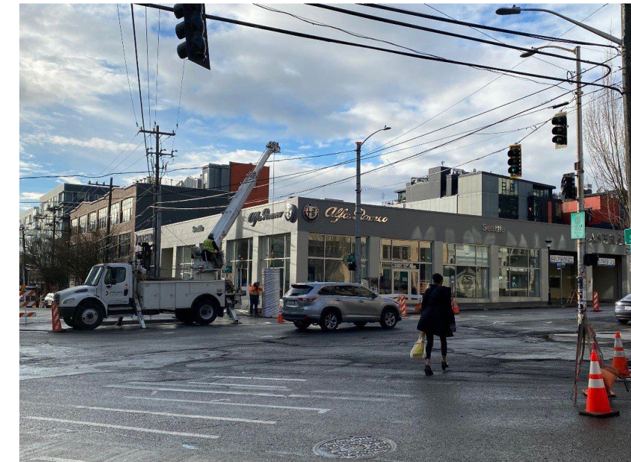
Bottom: Work occurring at the intersection of Madison St and 12 th Ave as part of Madison RapidRide G Line project