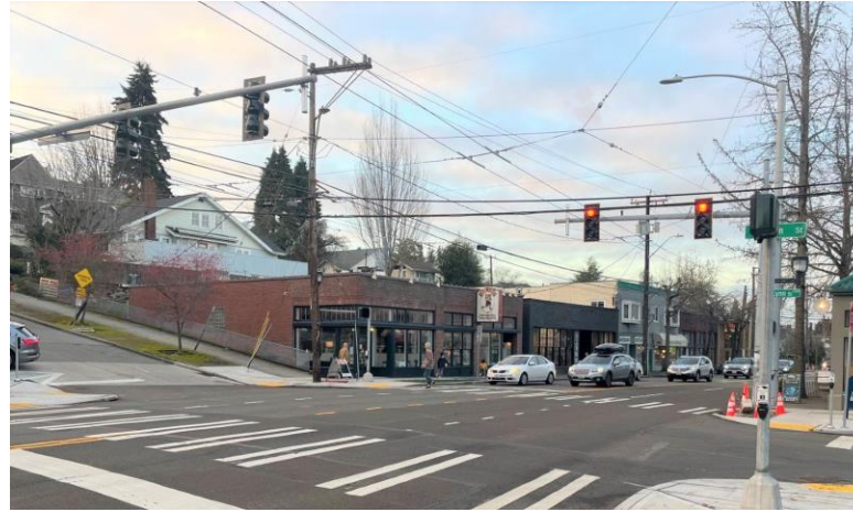
New signalized crossing at 24th Ave E and E Lynn St in Montlake.