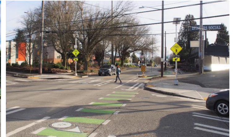
South Delridge Pedestrian Safety Enhancements project