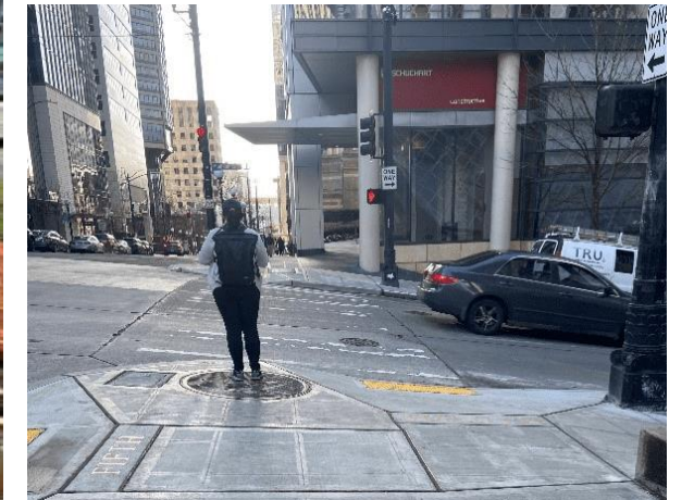
Rebuilt sidewalks and ADA-accessible ramps; shown here are new ADA curb ramps at 5th Ave and Madison St as part of RapidRide G Line project.