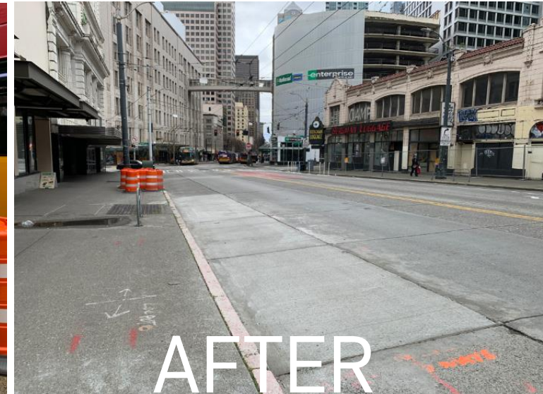
Before and after repaving on 3rd Ave between Stewart St & Virginia St.