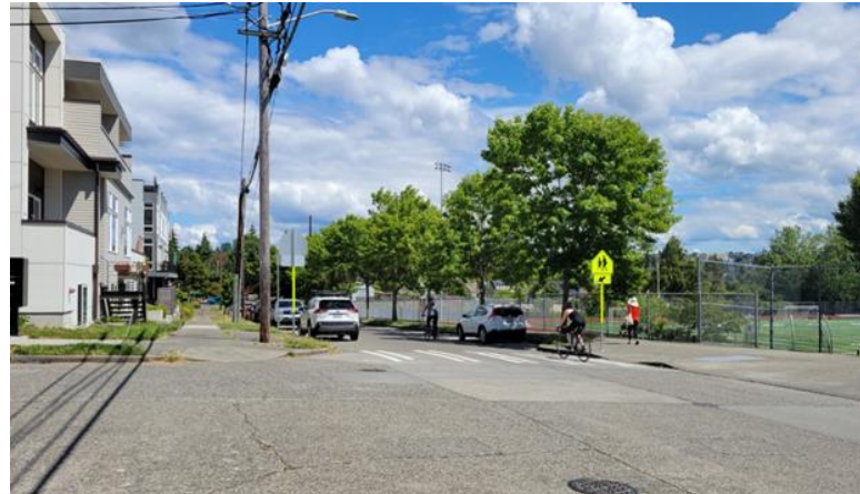
New crossing near Ballard High School for students walking, rolling, and biking.