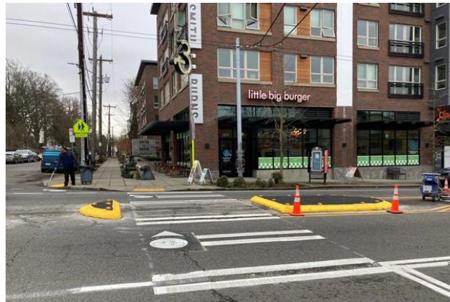
Crossing improvement at Interlake Ave N and N 45th St.