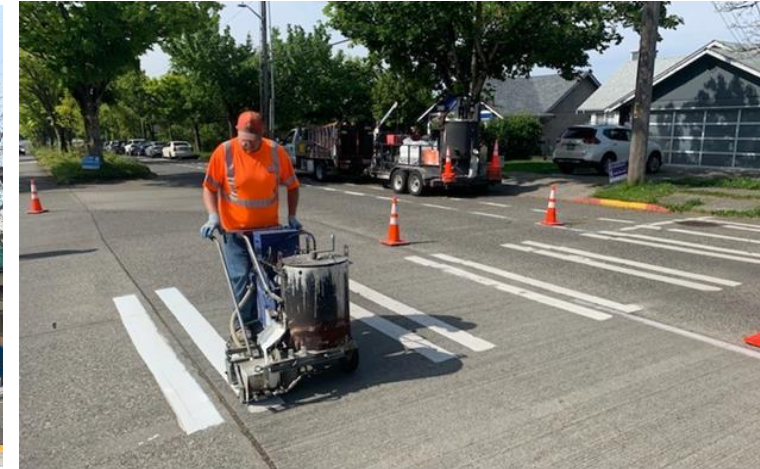
Remarking a crosswalk at 16th Ave SW and SW Findlay St.