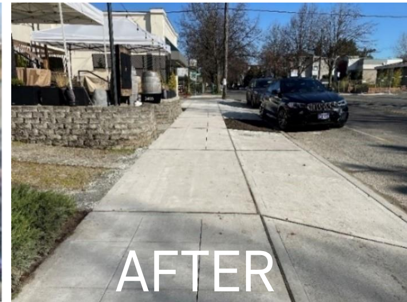
Top: Before and after sidewalk repair on California Ave SW and SW Brandon St