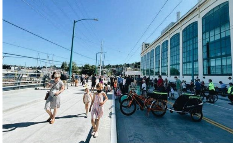
Fairview Ave N Bridge