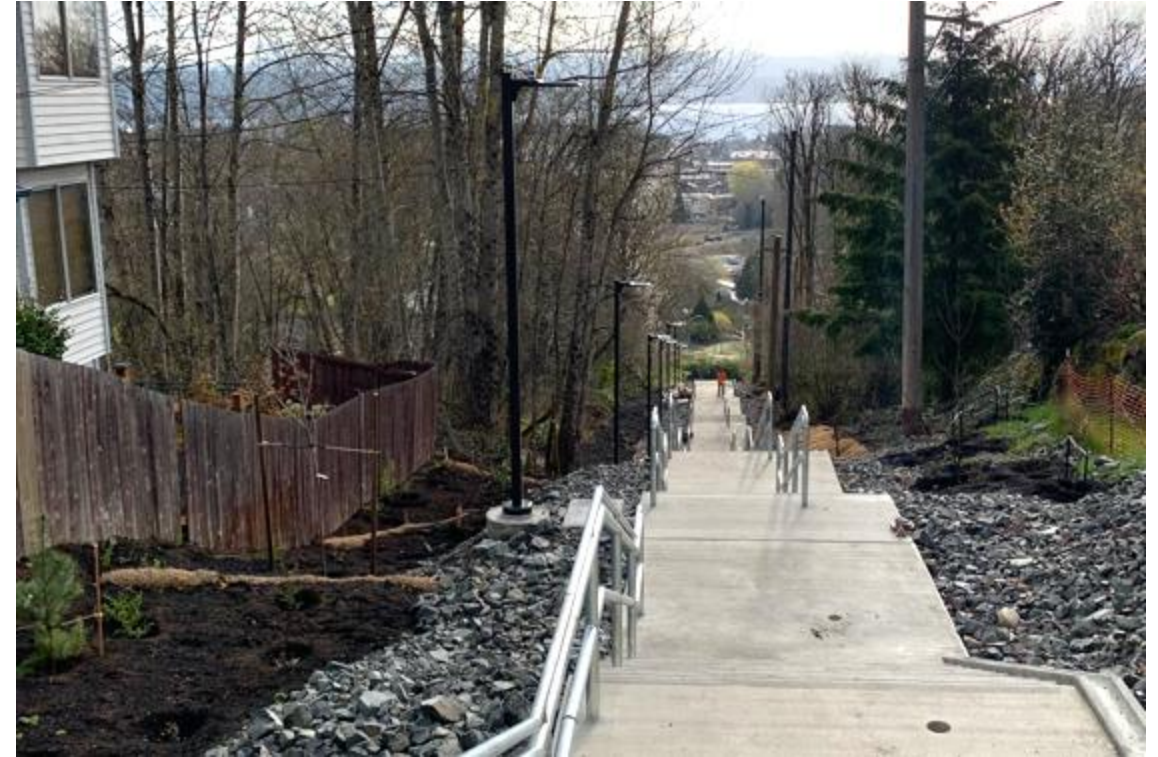
New stairway at S Henderson St.